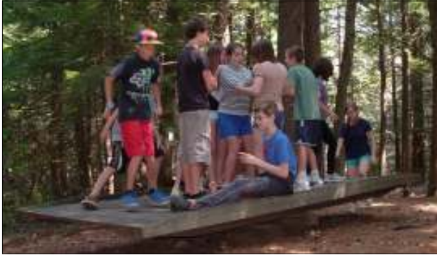
The eighth grade spent a day at Morse Hill, near Lake Wyola in Shutesbury

Who am I? What experiences shape who I am? How do I relate to others around me? And, what's next? Two weeks of 8th grade orientation culminated in the launch of our Guiding Questions for the year. Throughout Orientation, we worked to develop crew norms, to explore the transformation of a character named Cole in our summer reading book, Touching Spirit Bear , to individually reflect on who we are as we enter this school year, and to begin to form a vision of who we might want to be at the end of the year. Eighth grade is an exciting time in that it culminates in the first of three Four Rivers Passages. Next June our students will present their reflections on their middle school experiences, on who they are, and what they hope for in the future. Our orientation week set the stage for the year-long journey ahead.