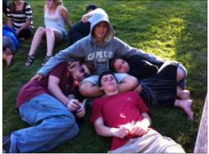
Above—Juniors chilling at Savoy.

The junior class began their year with a two-night camping trip to Savoy Mountain State Forest. We spent time on Wednesday swimming, playing games, and catching up after a summer apart. On Thursday, we did trail work, clearing brush and trash from several trails in the area, and then returned to our base camp to start setting goals and planning for the year ahead. We cooked our dinners over the open campfire, told ghost stories and riddles, made s'mores, and spent time together as a whole grade and as individual crews. On Friday, we returned to school to talk about the academic year ahead, to solidify our goals for the semester, and wrap up a great orientation week.