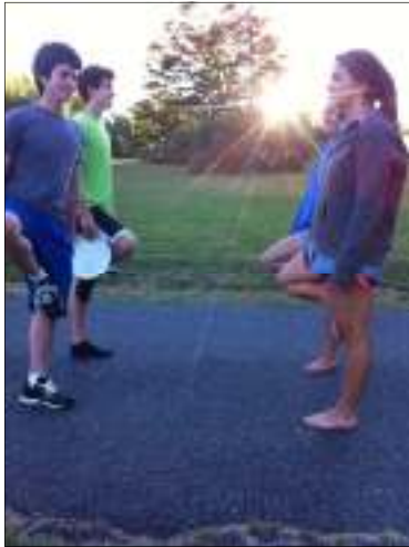
Below— Talking about goals